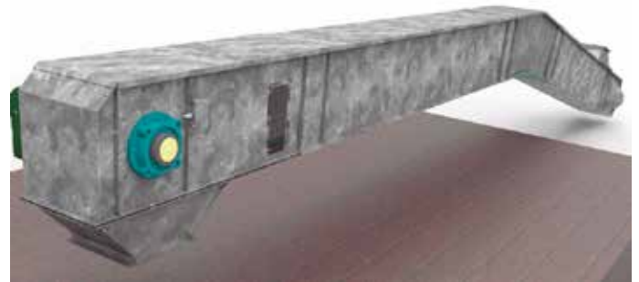
Example 4. Starting from the loading of the conveyor in an inclined orientation, obstacles can be passed over and the transport continued along a horizontal section.