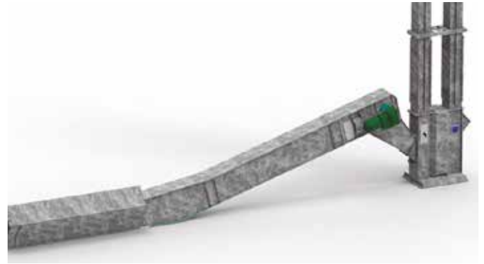
Example 2. Connection of the intake pit conveyor to the elevator lowering the depth of the pit. This option avoids the need to carry out civil engineering work and allows the elevator to be placed on the same level as the chain conveyor.